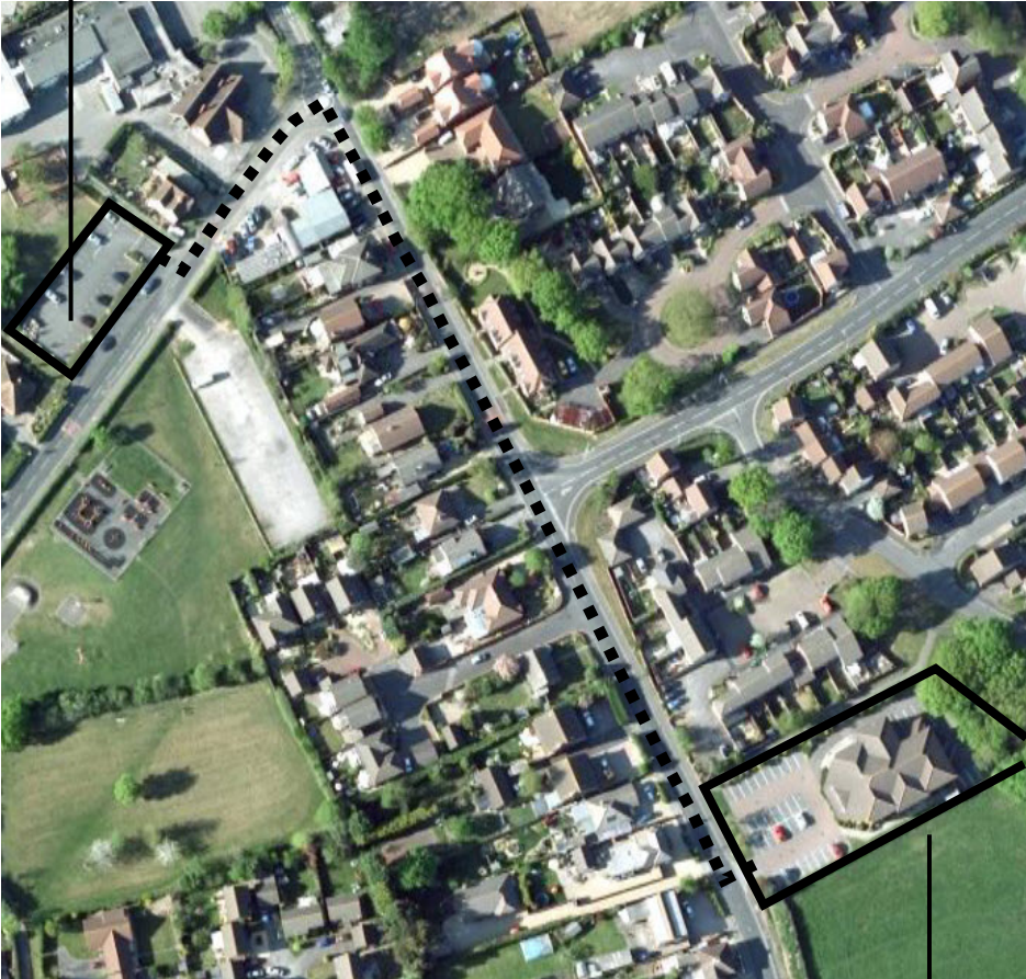
Locks Heath Free Church

St John's School are allowing LHFC use of their Car Park on Sundays. Please consider using this car park instead of parking in Hunts Pond Road and Ascot Close. St John's School Car Park open from 10.15am on Sundays